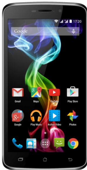
ARCHOS 52 Platinum

These smartphones also feature the best in multimedia on Android thanks to ARCHOS Media Center applications.