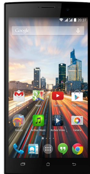
ARCHOS 62 Xenon